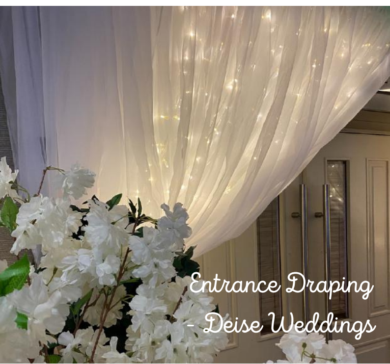
Entrance Draping - Deise Weddings