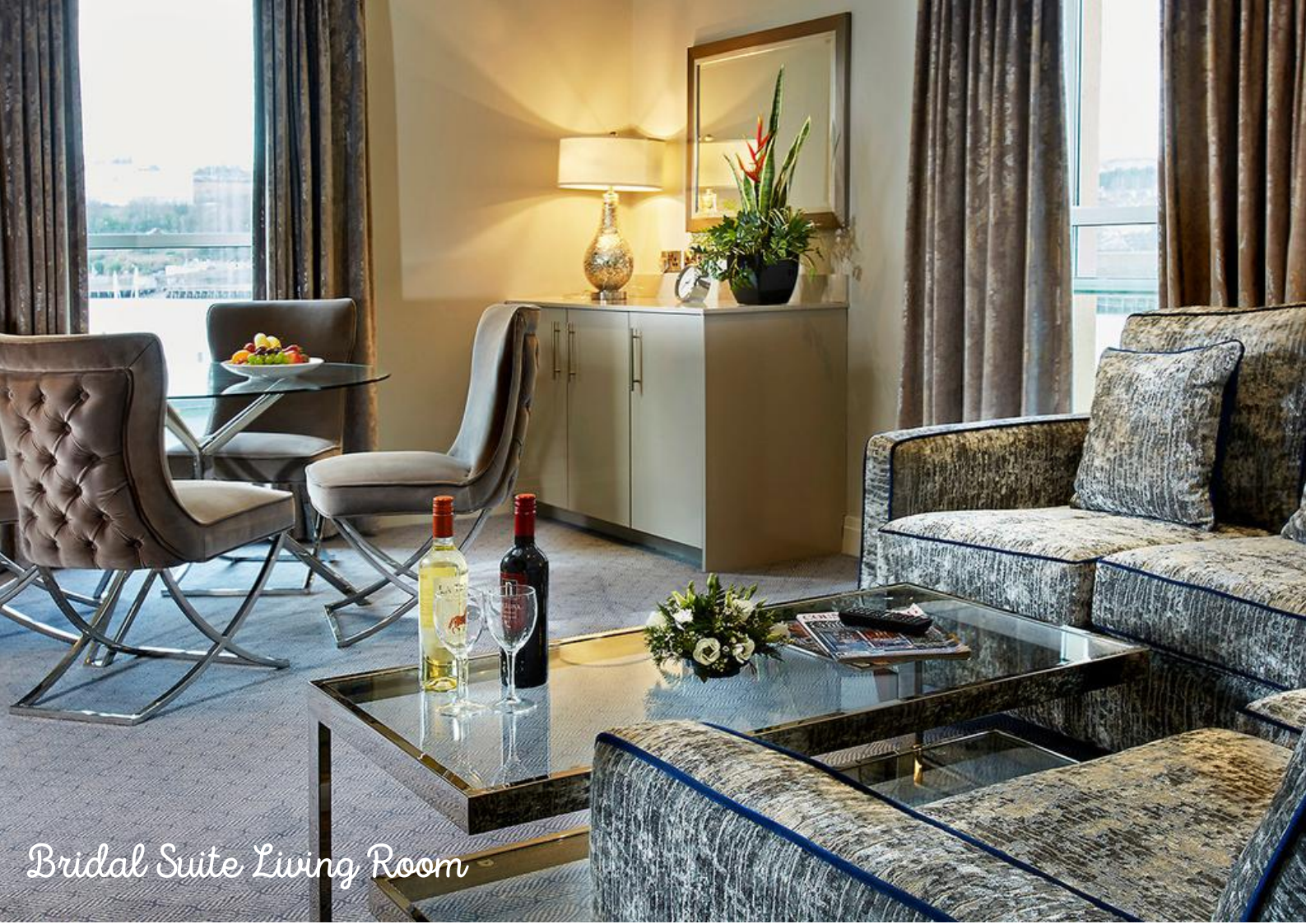
Bridal Suite Living Room