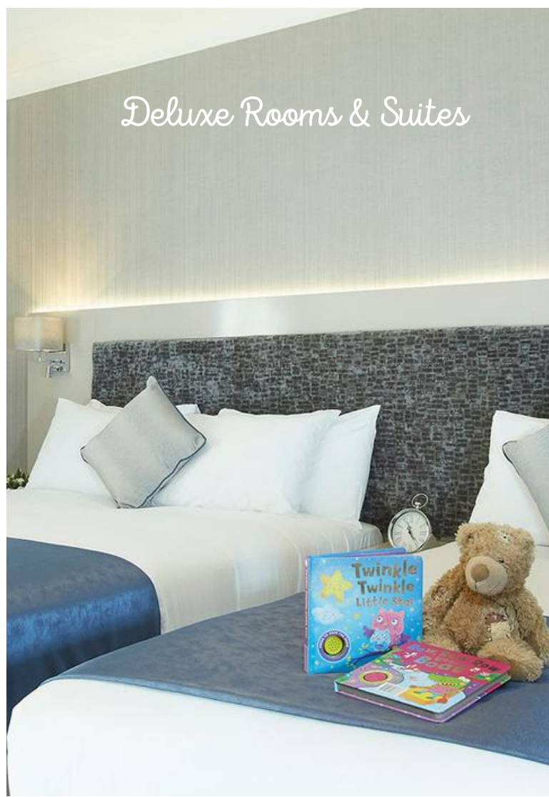
Deluxe Rooms & Suites