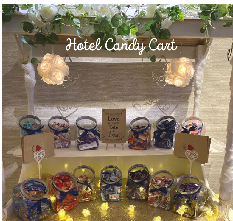
Hotel Candy Cart