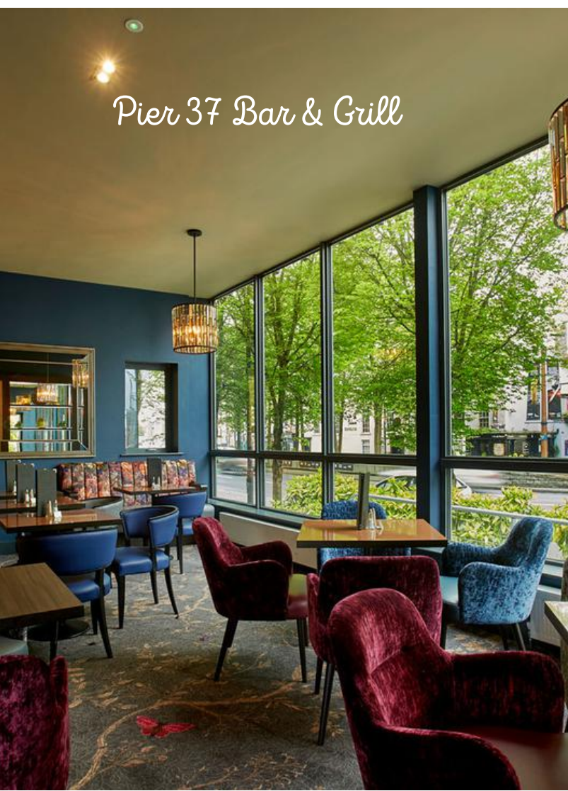
Pier 37 Bar & Grill