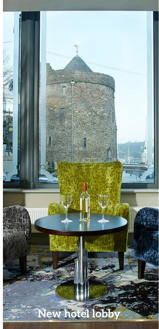
New hotel lobby