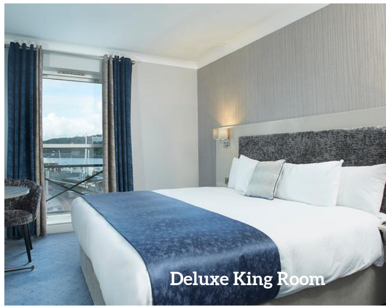
Deluxe King Room