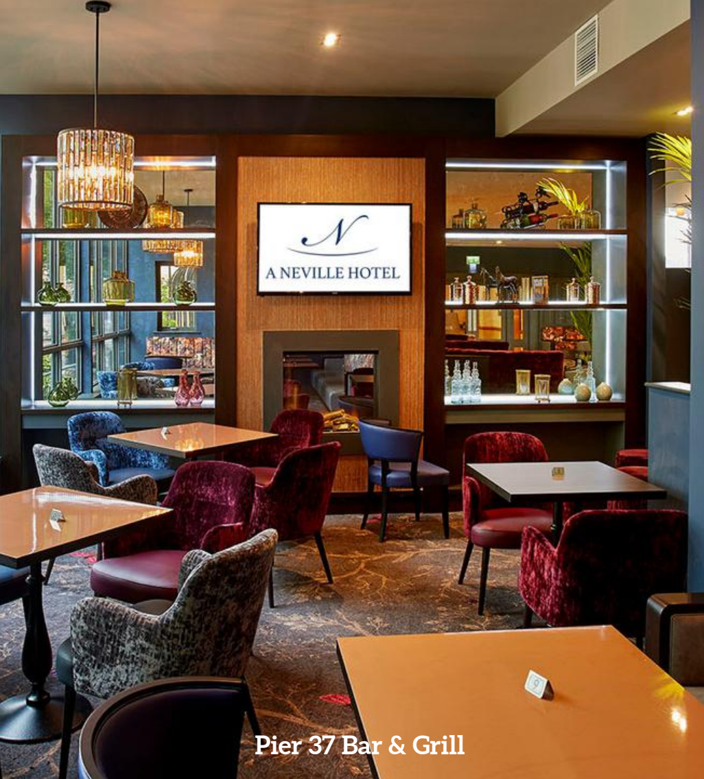
Pier 37 Bar & Grill