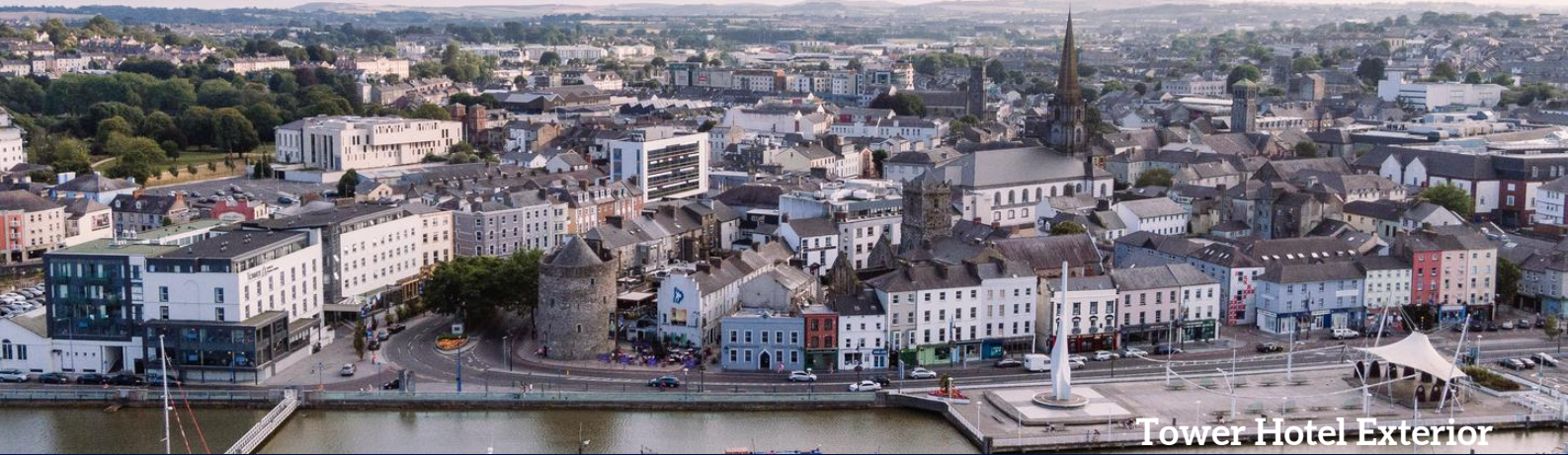
Tower Hotel Exterior