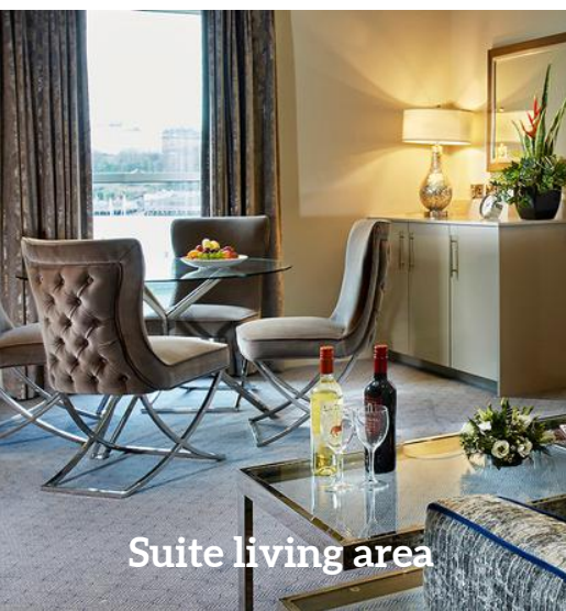
Suite living area