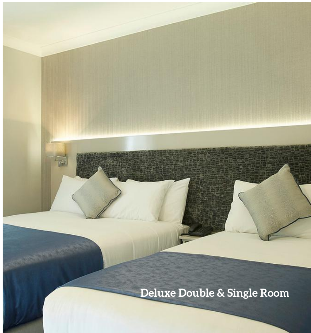
Deluxe Double & Single Room